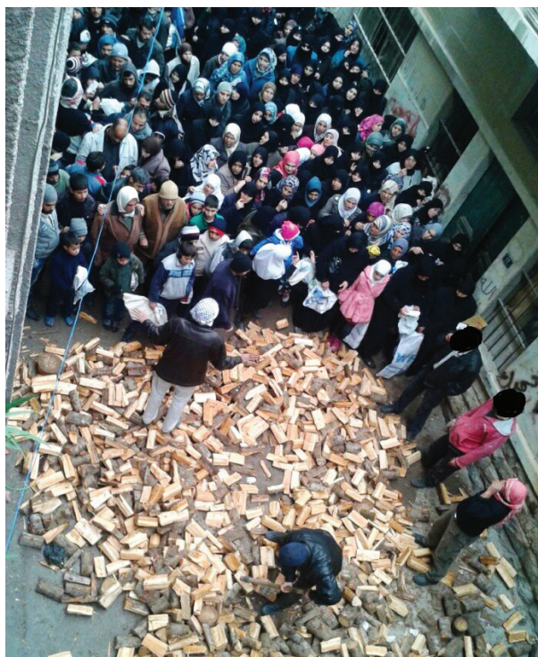
Above: Women gather at a firewood distribution point in southern Syria. Opposite Page: Men watching over children at a collective center for Syrian refugees in Saida, Lebanon, where CARE has provided families with cash assistance.