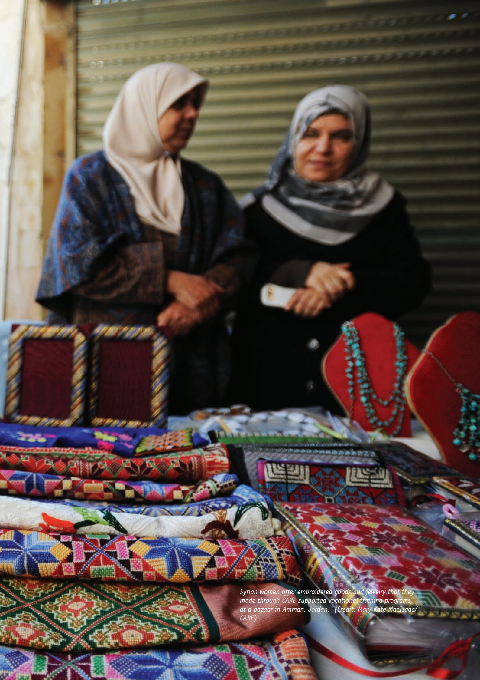
Syrian women offer embroidered goods and jewelry that they made through CARE-supported vocational training programs, at a bazaar in Amman, Jordan.